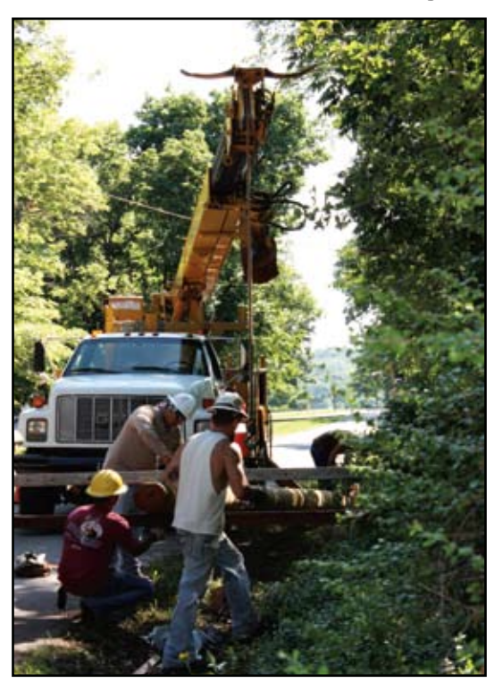
Winsett Electrical Contractors working in the Black Gum Area along Ridge Route Road.

In order to accommodate an increasing electric load, as well as provide improved reliability and power quality, Cookson Hills Electric Cooperative is upgrading facilities in the Black Gum Area along Ridge Route Road. This area is on the south side of Lake Tenkiller just east of the Tenkiller State Park.