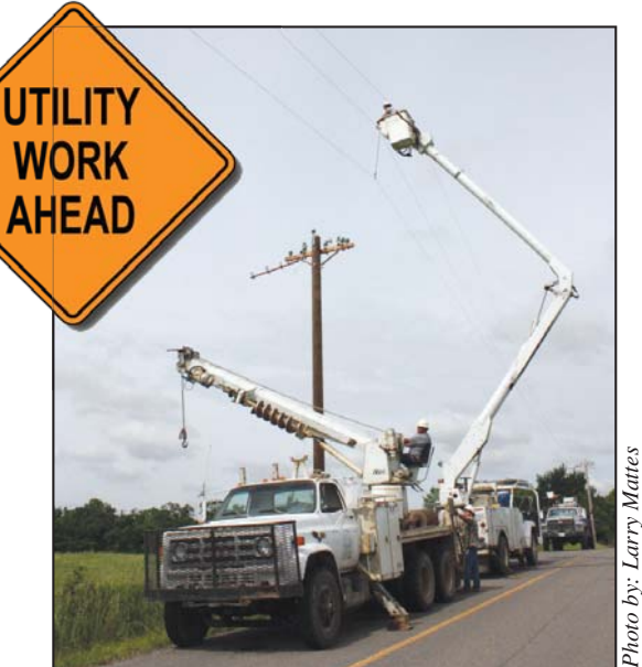
Contractor Gordon Construction working along Beaver Mountain Road south of Whitefield.

Many poles will be replaced with larger class poles making the pole line much stronger. The addition of an extra phase will give Cookson Hills Electric Cooperative the ability 89000 to back feed loads during storm and emergency conditions.